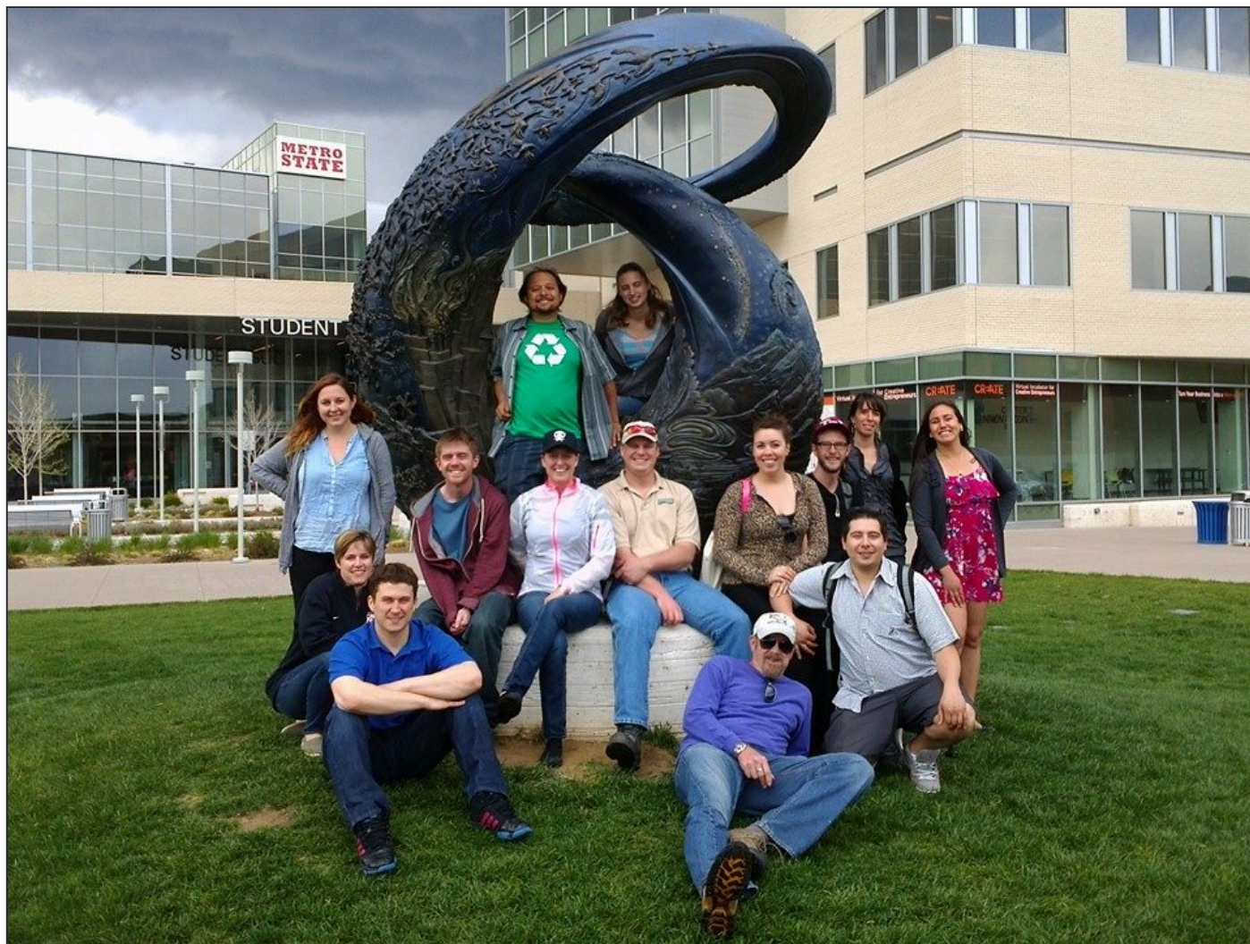
Student Club: Water Association of Student Stewards Urban Program (WASSUP Club)